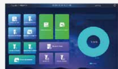
Professional version (optional)

The stored item management system was developed for users who use freezer racks, boxes and vials, the system can easily record the item locations, entry and exit records, facilitate item inventory and statistics with multi-screen interaction and reduce errors through secondary verification.